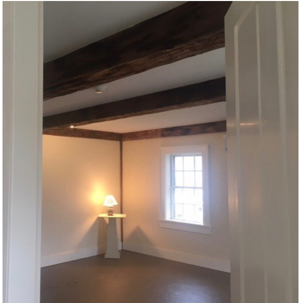
The door is open, the lights are on, the mini-split is humming softly. Our three new upstairs rooms are beautiful and ready for use!

We are MOST happy to announce that, after ten years of fund-raising and hard work by dozens of hands, every room in the historic Hall-Dyer House is now useable! Insulated, heated and cooled, painted, available for exhibits, research, activities, and storage. We still have some fine-tuning like painting trim, removing wallpaper, re-routing a duct down cellar, finishing closets, and installing snow stops and window shades - but the heavy lifting is complete. See inside for details, and especially THANKS!