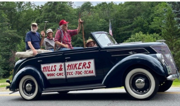
We tooted our own horn in the July 4th parade, and later hosted old car rides and wagon rides.