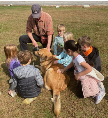
Brett first graders meet friendly Chinook descendant - and set off for the South Pole.