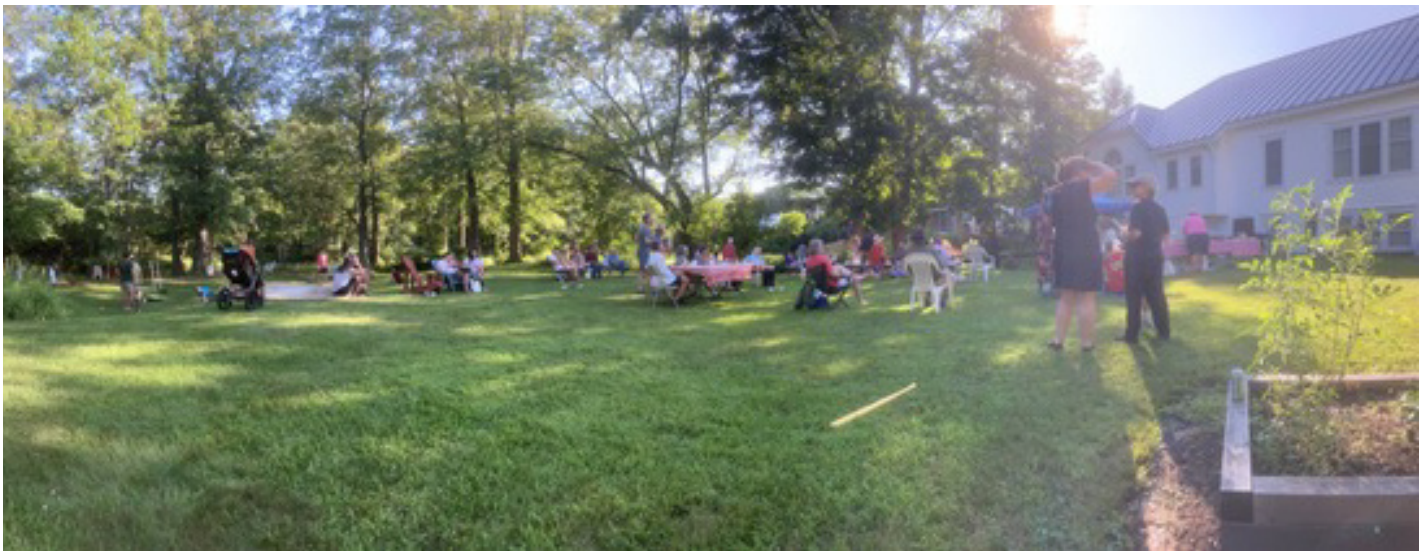
July 22 Family Picnic and Story Swap